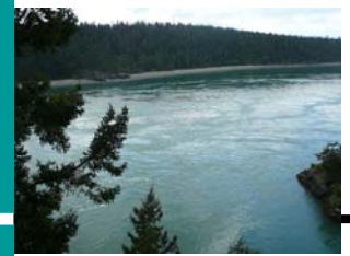
Barrington Professional Center

161 SE. Barrington Drive, Oak Harbor, WA. 98277 ( Highway 20 )